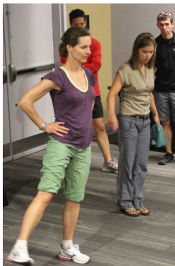
Running Injuries Workshop 2012

BC Place Stadium 777 Pacific Blvd Vancouver, BC V6B 4Y8