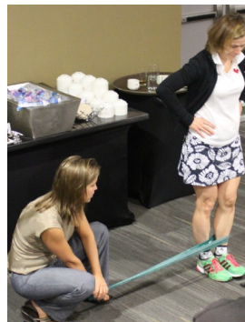
Running Injuries Workshop 2012