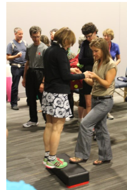
Running Injuries Workshop 2012